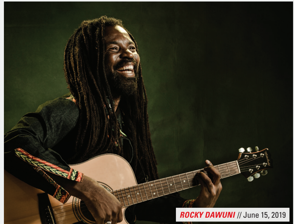
ROCKY DAWUNI // June 15, 2019