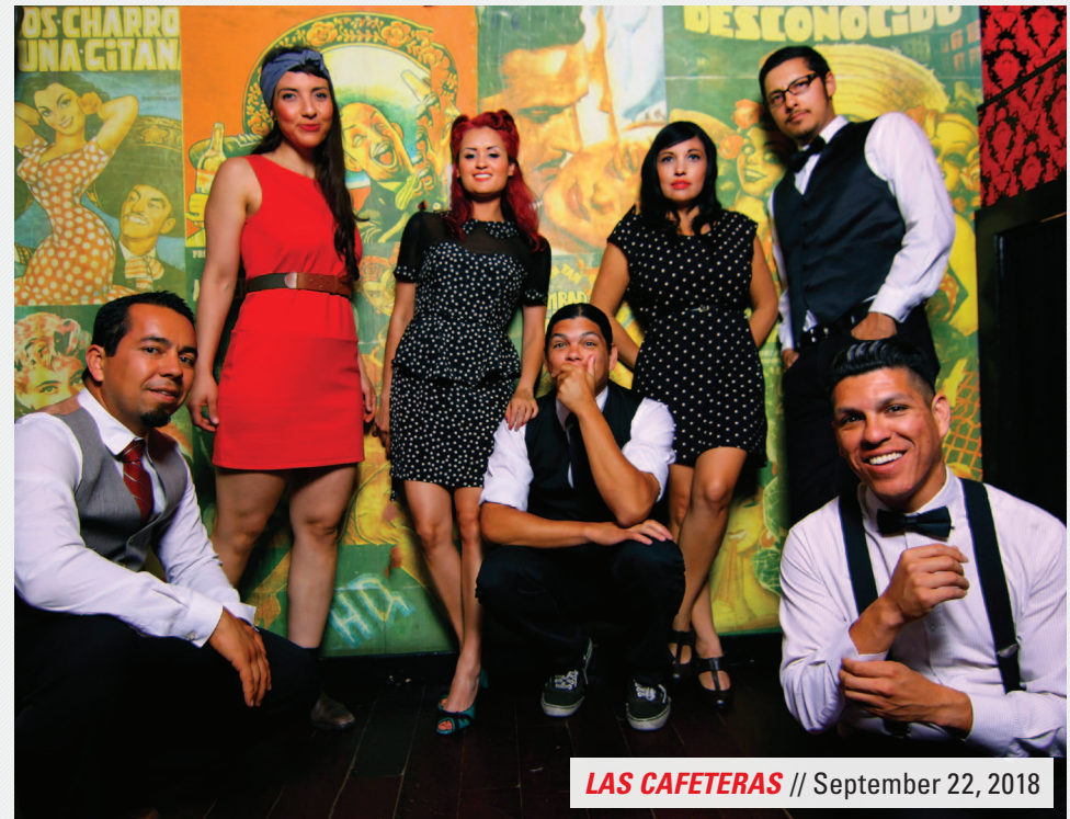
LAS CAFETERAS // September 22, 2018

KUGELPLEX Since time forgotten, Klezmer musicians have wandered the cities and countrysides of Eastern Europe bringing the party to the people. Called the “rockin-est” purveyors of that genre, this six-piece ensemble (accordion, bass, clarinet, piano, saw, violin, vocals) is purveyor of this exuberant musical tradition. Passed down from generation to generation, they play traditional instrumentals and old-world party music of the East European Jews. Delivering wild, soulful dance music at concerts, festivals and Jewish lifecycle events throughout the United States, the band has performed with Joan Baez, the Oakland Symphony, the Oakland Interfaith Gospel Choir, Linda Tillery, and many more.