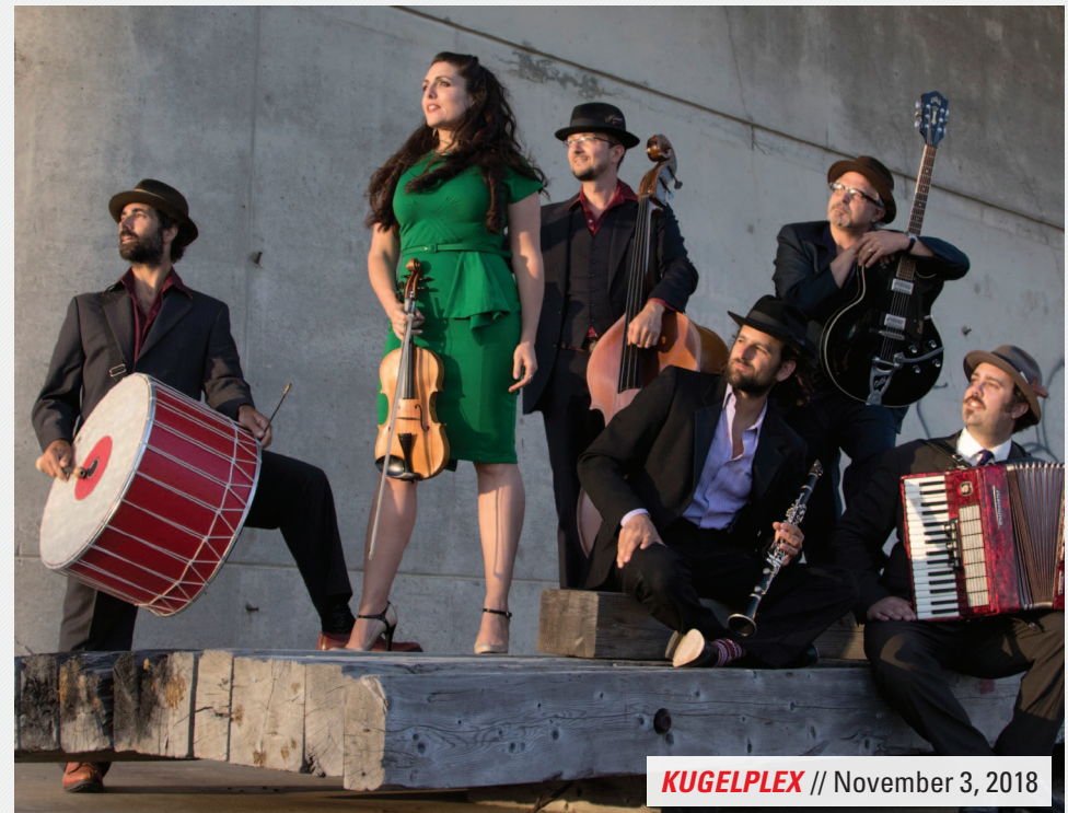
KUGELPLEX // November 3, 2018