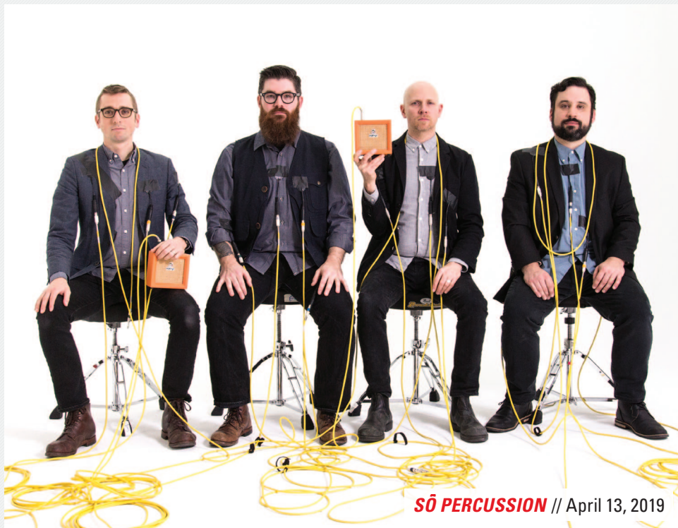
SÔ PERCUSSION // April 13, 2019

SÔ PERCUSSION Sô Percussion has redefined the scope and vital role of the modern percussion ensemble with innovative multi-genre original productions, sensational interpretations of modern classics, and an “exhilarating blend of precision and anarchy, rigor and bedlam,” ( The New Yorker ). Sô’s repertoire ranges from “classics” of the 20th century, by John Cage, Steve Reich, and Iannis Xenakis to commissioning and advocating works by contemporary composers such as Caroline Shaw, David Lang, Steve Mackey and Paul Lansky. They also compose and perform their own works, ranging from standard concert pieces to immersive multi-genre programs.