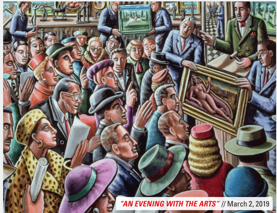
"AN EVENING WITH THE ARTS" // March 2, 2019