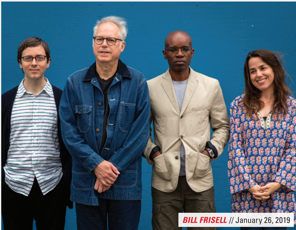
BILL FRISELL // January 26, 2019